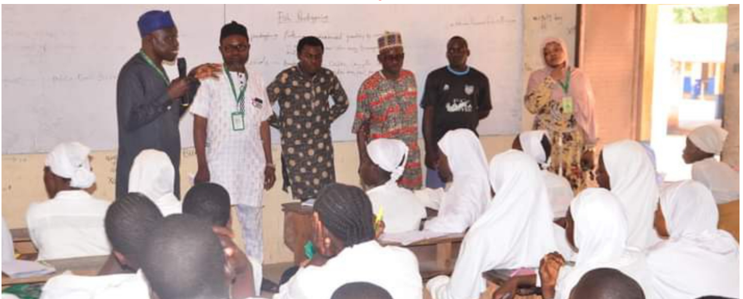
A cross-section of students participating in the programme.