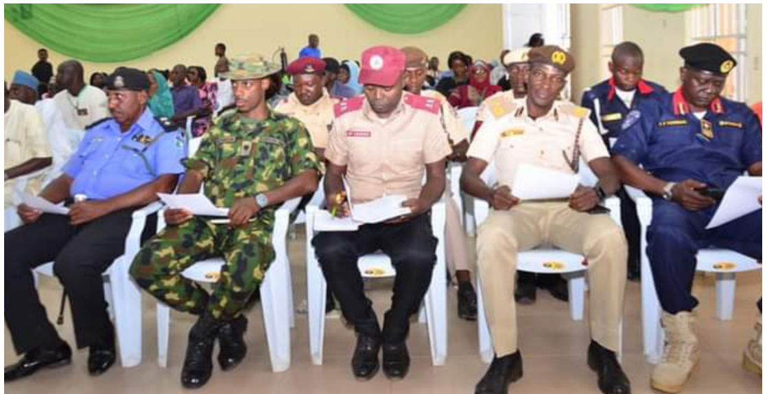
Security officers at the event.