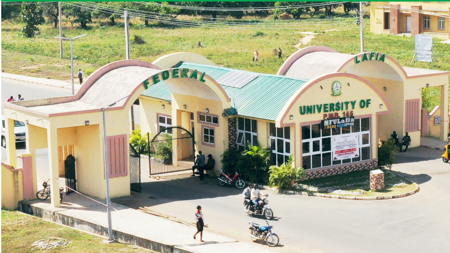
Gate House, Permanent Site Campus, Federal University of Lafia.