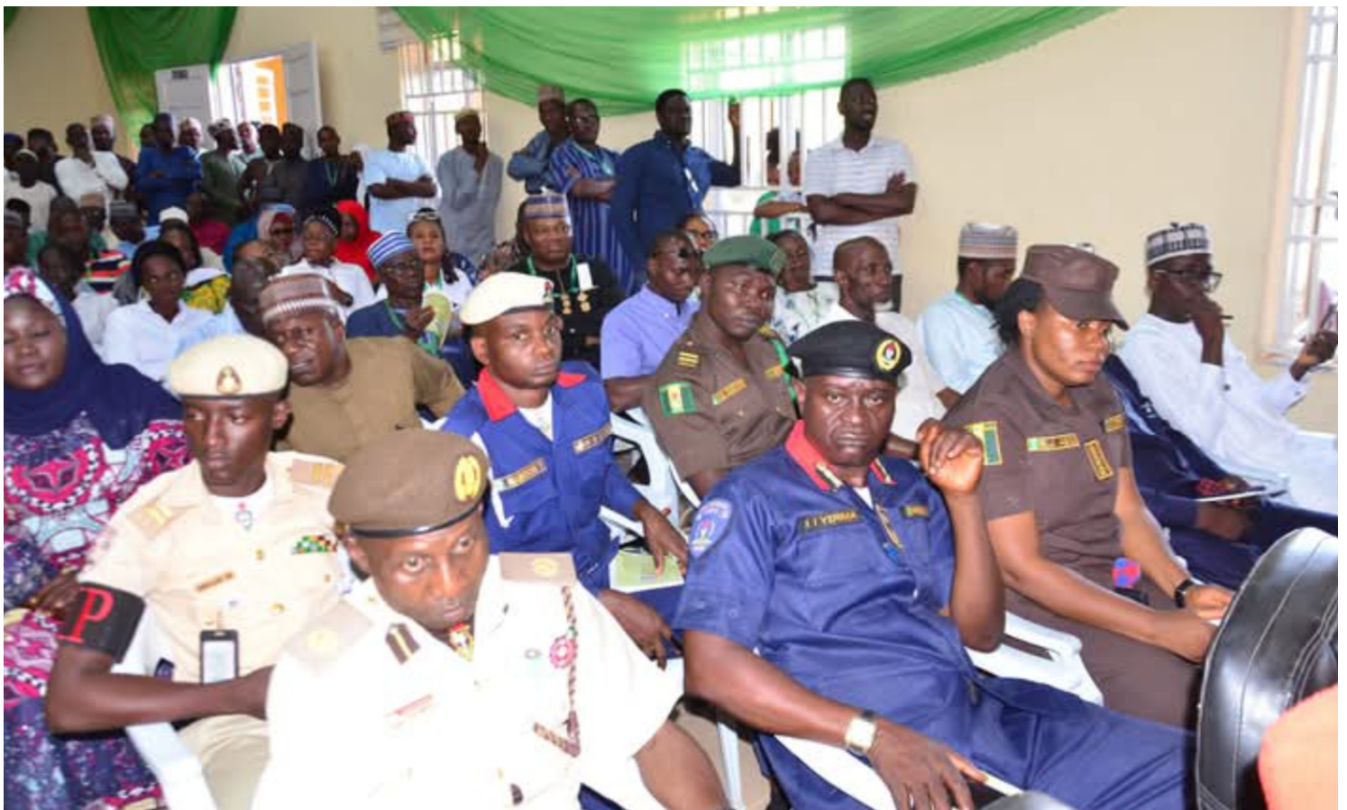
Security officers at the event.