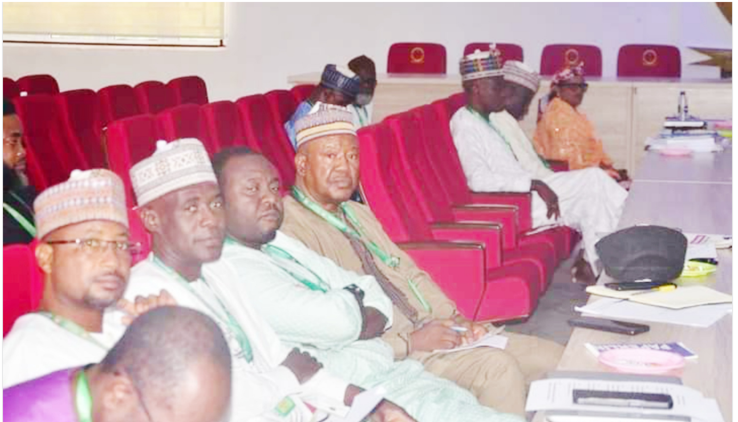
A cross-section of Deans and Deputy Deans in attendance.