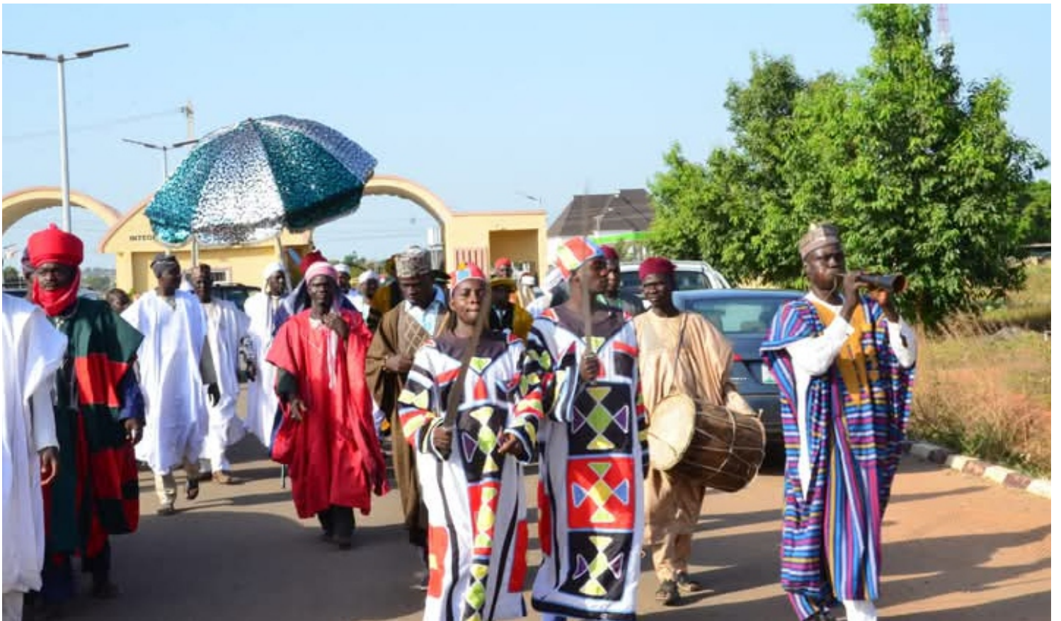
Palace guard leading the Emir of Lafia to the inaugural lecture.