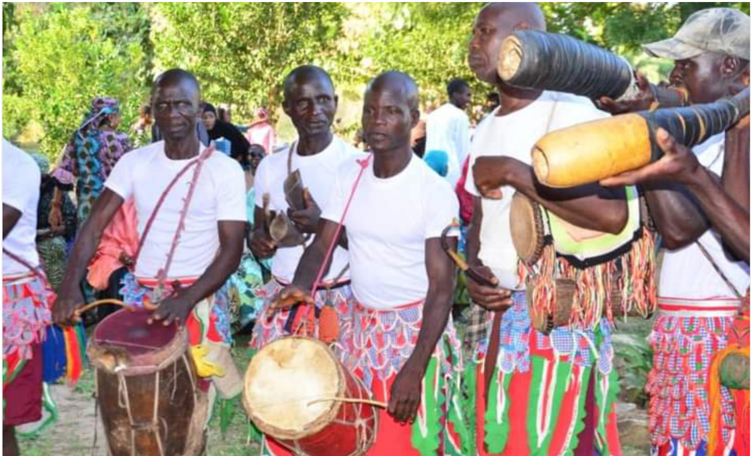
Vibrant Eggon traditional dancers.