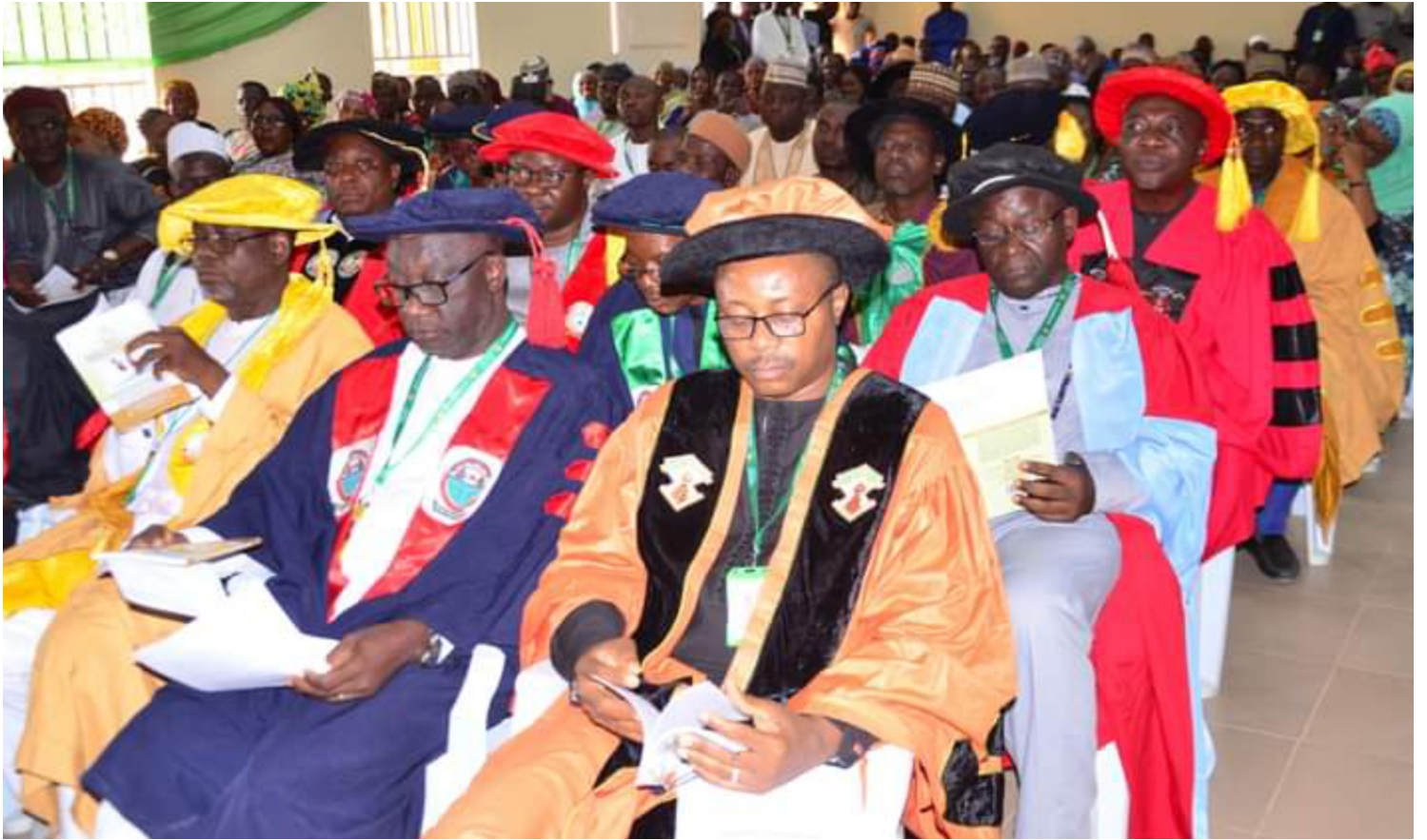
Cross-section of Senate Members of FULafia.