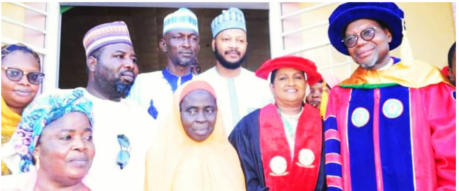
Shugaba with family members.